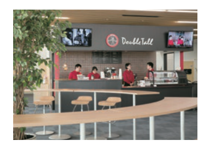
Shibuya Double Tall Cafe

There are 3 cafeterias in our campus with various menus. The Memorial Hall cafeteria is the newest and it commands a fine view of the Ishikari Plains.